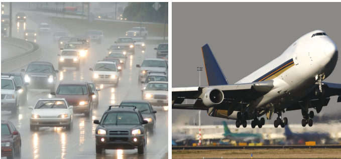
Suitable for a range of applications.

Airports need to monitor visibility across the airfield to ensure the safety of taxiing aircraft, for Runway Visual Range (RVR) calculation and for transmission to aircraft as part of the METAR. The SWS-200 can fulfil all of these roles and also provides present weather information for inclusion in METAR reports.