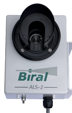
Biral's ALS-2 Ambient Light Sensor

The SWS sensor family is designed for easy installation by a single person and has an interface which simplifies system integration. The ASCII text data message is transmitted at user defined time periods or in response to a polled request. The standard data message provides MOR and EXCO along with present weather codes according to both WMO Table 4680 and METAR standards. An optional interface to the ALS-2 Ambient Light Sensor simplifies use in aviation applications where both METAR and RVR information is required. The ALS-2 Ambient Light Sensor data is appended to the standard sensor data message simplifying both installation and data processing.