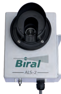
Biral's ALS-2 Ambient Light Sensor

The SWS sensor family is designed for easy installation by a single person and has an interface which simplifies system integration. The ASCII text data message is transmitted at user defined time periods or in response to a polled request. The standard data message provides MOR and EXCO along with present weather codes according to both WMO Table 4680 and METAR standards. An optional interface to the ALS-2 Ambient Light Sensor simplifies use in aviation applications where both METAR and RVR information is required. The ALS-2 Ambient Light Sensor data is appended to the standard sensor data message simplifying both installation and data processing.