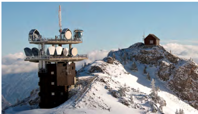
The SWS-250 is ideally suited to provide accurate measurement of raw data for forecasting models.

Whilst the models used for forecasting continue to improve there remains a need for accurate measurement of current weather conditions to provide the model's input. Improvements to forecast accuracy can also be gained by increasing the number of monitoring sites but there is always a trade-off between forecast quality and cost. The SWS-250 is ideally suited to this type of application due to the accuracy of measurement, the wide range of present weather conditions reported and the cost effective design.