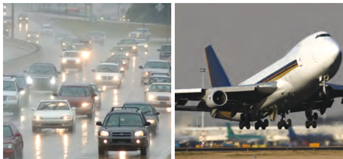
Suitable for a range of applications.

In aviation there is a trend towards increasing both safety and capacity at aerodromes which can require the installation of visibility and present sensors on runways and increasingly along taxi ways. The SWS-250 meets or exceeds all international aviation specifications for visibility measurement and present weather reporting whilst offering an affordable solution for both acquisition and cost of ownership.