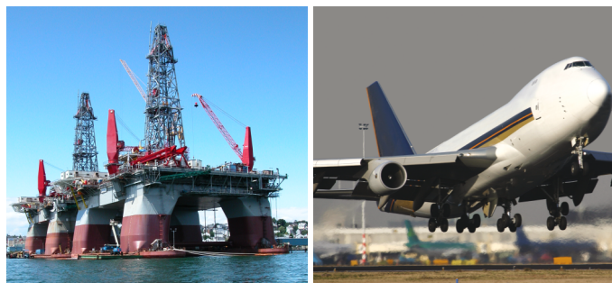
Suitable for a range of applications.

In offshore and general aviation, the costs of servicing or replacing a sensor can be significant. When the equipment is installed offshore access is difficult and expensive, whilst for any aviation use there are significant costs due to restrictions imposed when equipment is not operational. Many VPF series installations are in the most extreme of environments where they have a reputation for reliability and long life. The operational life of the VPF sensor in such environments is frequently in excess of 10 years.