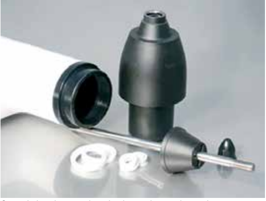
Ceramic bearings are long lasting and corrosion resistant.