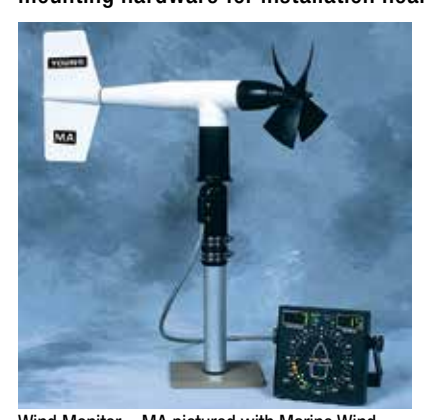
Wind Monitor – MA pictured with Marine Wind Tracker display.

For specific applications, separate signal conditioning devices are available. Model 05603C Wind Sensor Interface offers calibrated 0-5VDC outputs for wind speed and wind direction. Model 05631C Wind Line Driver provides calibrated 4-20 mA current signals for each channel, useful in high noise areas or for long cables of up to several kilometers. Each interface circuit is supplied in a weatherproof junction box with mounting hardware for installation near the sensor.